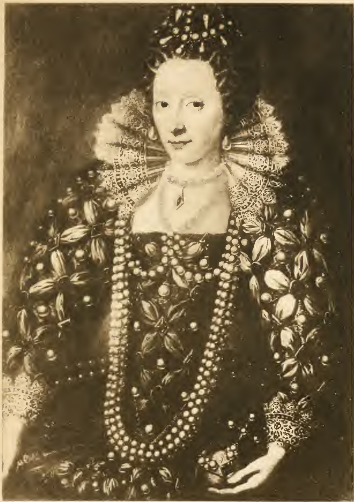
Portrait of a woman in pearls and leaves, by Hans Holbein the Younger, 1533.